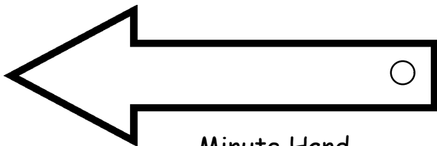
Minute Hand - Color Red